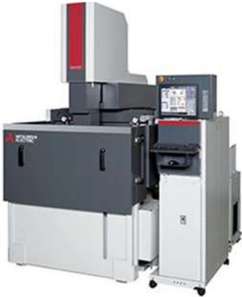
Mitsubishi CNC EDM