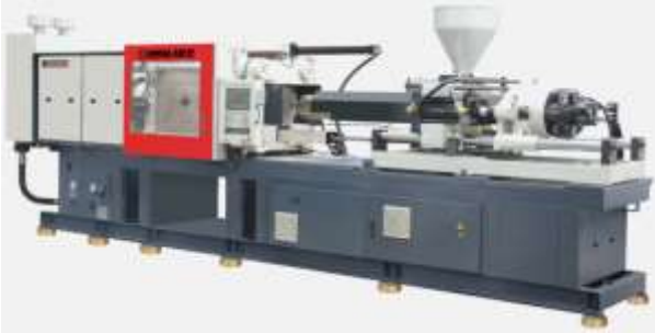
Injection Moulding M/c

Microprocessor controlled closed loop Injection Molding Machines ( Ferromatic Milacron ) with to process engineering plastic materials.